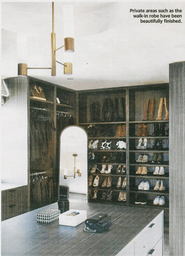
Private areas such as the walk-in robe have been beautifully finished.