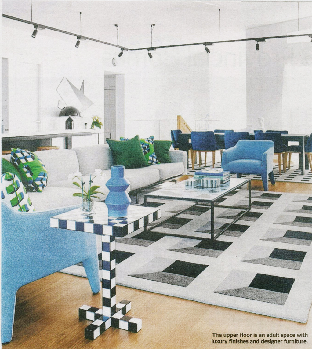
The upper floor is an adult space with luxury finishes and designer furniture.