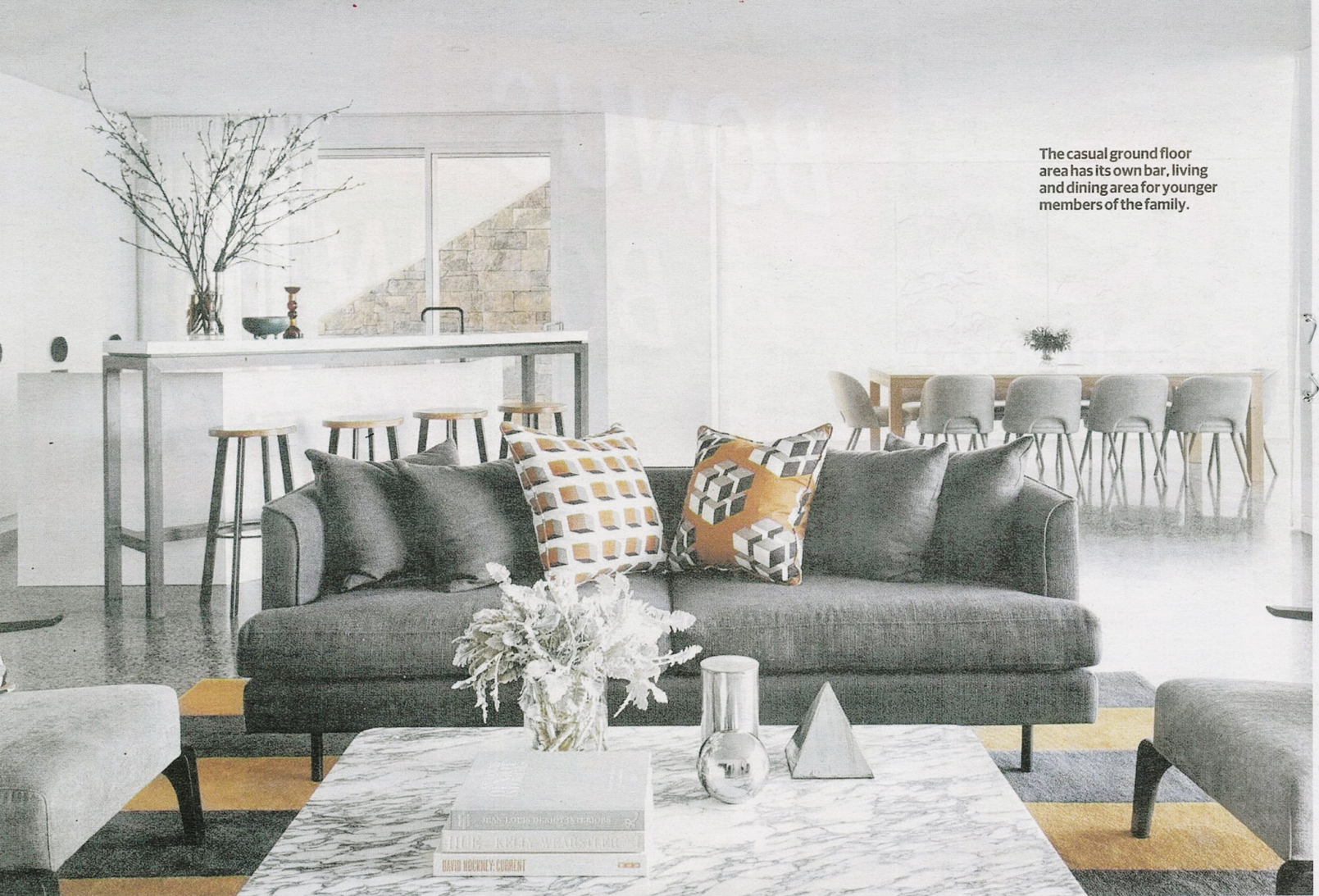
The casual ground floor area has its own bar, living and dining area for younger members of the family.