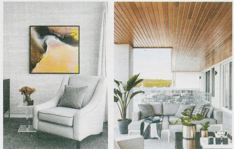
The ground floor areas are finished in polished concrete which is stylish but robust.