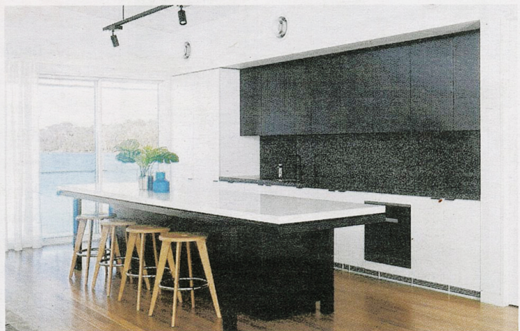
The understated kitchen on the upper floor enjoys views of the lake.

To meet the owners' brief for a stylish but robust family home, Stewart split the house in